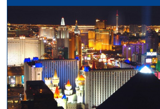
The world-famous Las Vegas Strip