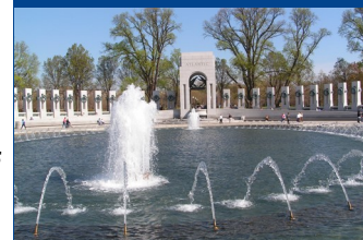
World War II Memorial