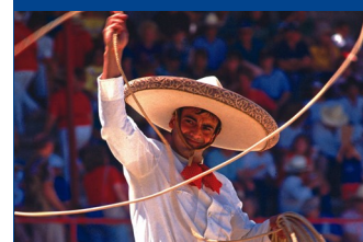
Enjoy the sights and sounds of San Antonio

Departure: Fireworks Nation, 5158 Jackson St, Oshkosh, WI @ 8 am