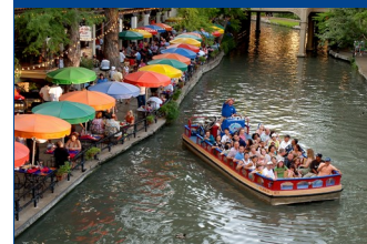
Relax on a cruise at the famous River Walk